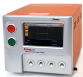
Isaac HD Multi-Function Leak Tester