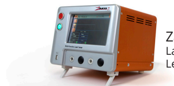
Zaxis 7i Large Display Leak Tester