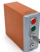
iKit Single Channel Leak Tester