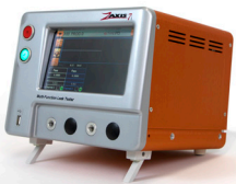
Zaxis 7i Large Display Leak Tester